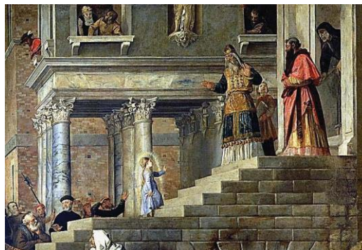
Presentation of Blessed Virgin Mary

While most people admire superficial traits, like charm that can deceive and beauty that swiftly fades, this poem declares that truly praiseworthy is the valiant woman. She is shaped by wisdom, which, as the opening verses of Proverbs declare, begins with “the fear of the Lord”. People should talk about her and those like her at the “city gates”, the place where one catches up on the news in the biblical world. (From the Workbook for Lectors, Gospel Readers, and Proclaimers of the Word. )